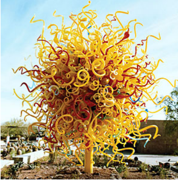
Desert Botanical Garden, Phoenix

You don't have to know a zinnia from zoysia to be wowed by these dazzling gardens